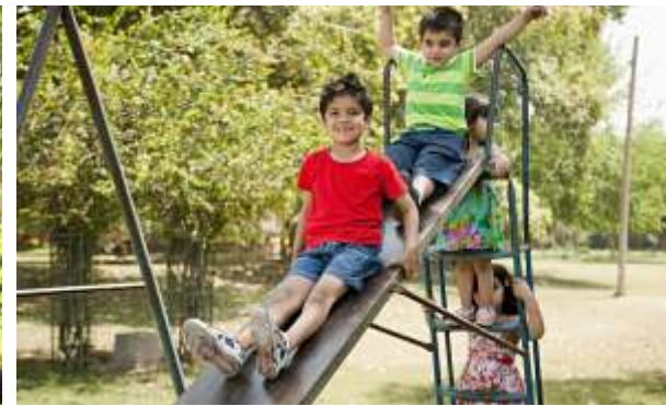
Children's Play Equipment