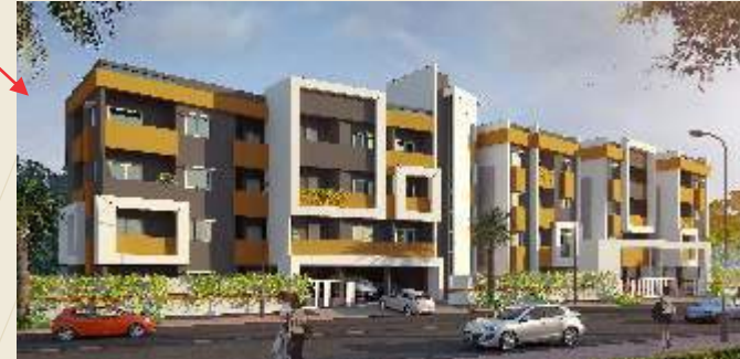
Site Address- Hita Lirio, Ayappa Swamy Temple Road, Opp. Sub-Registrar Office, Varthur, Bengaluru, Karnataka- 560087.